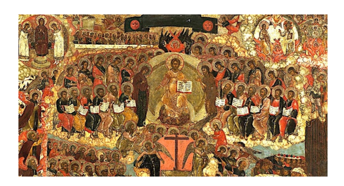
Dismissal & Memory Eternal May their souls dwell with the blessed.

PRIEST: O God of spirits and of all flesh, Who have trampled down death and made powerless the devil and given life to Your world: Give rest, O Lord, to the souls of Your departed servants, all pious and Orthodox Christians, who have fallen asleep in the Lord, from all the ends of the world: kings, patriarchs, bishops, priests, deacons, monastics, parents, grandparents, great-grandparents and forebears, siblings, spouses, children, youths, brethren, and all our kinsmen, especially those we now name in our hearts... Give rest, O Lord, and have mercy on all our departed loved ones, relatives and friends, in a place of brightness, a place of green pastures, a place of repose, where all sickness, sorrow, and sighing have fled away. Pardon every sin which they have committed, whether by word or deed or thought; for You are good and love mankind, and there is no man who lives and sins not, for You only are without sin, and Your righteousness is to all eternity, and Your word is truth. For You are the Resurrection and the Life and the Repose of Your departed servants, O Christ our God, and unto You we ascribe glory, together with Your unoriginate Father and Your all-holy, good, and lifegiving Spirit, now and ever, and unto ages of ages. Amen.